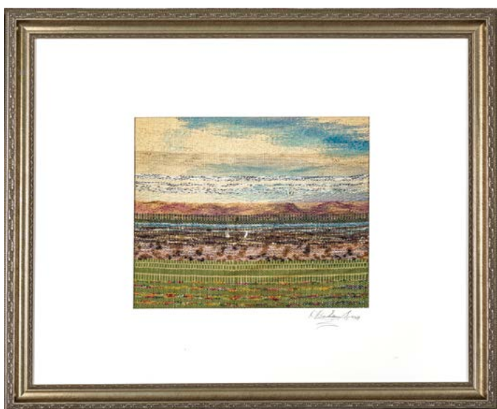
Phyllis Packard, Vermillion; Prairie Illusions, Missouri River Bluffs , weaving as watercolor