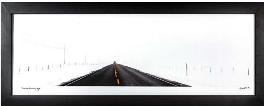
Galen LaRoche, Pine Ridge; Leaving Standing Rock , photography print