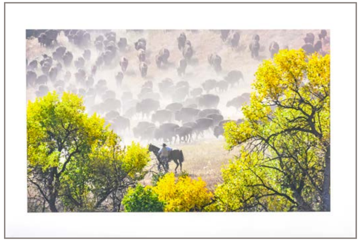
Randall Royer, Pierre; Cowboy at Buffalo Roundup , photo print