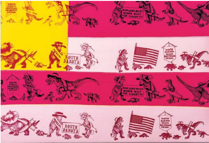
Klaire Lockheart, Vermillion; Suffragist Sue Flag , ink on fabric on canvas

The selection committee for the Art for State Buildings program met April 8, 2021, to determine purchases for the state's public art collection, on display in the Capitol and other state buildings in the Capitol complex in Pierre. The committee reviewed and scored proposals from 31 artists and agreed to purchase 13 new artworks from 12 artists. The $20,100 budget supported the acquisition, shipping, and installation of those artworks shown here and also on page 3.