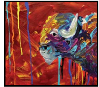
EASTON SCHWARTZ, 8th grade Buffalo Selby Area Schools, Selby, SD