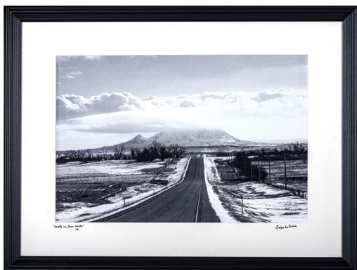
Galen LaRoche, Pine Ridge; South to Bear Butte , photography print