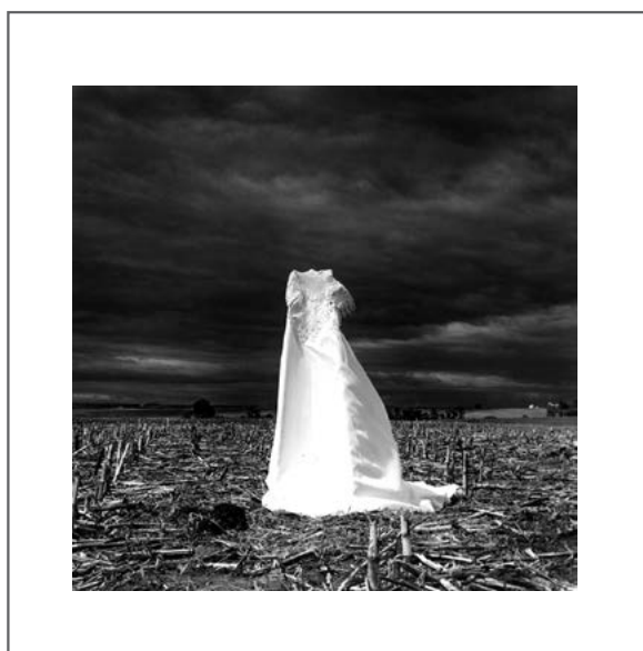
Jill Kokesh, Fort Pierre; Wedding Dress Burial , photography, gelatin silver print