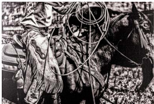
Cristen Roghair, Okaton; Authentic Cowgirl , photo giclée canvas wrap