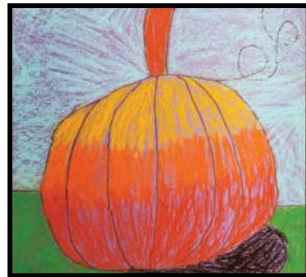
EVA LINDHOLM, 2nd Grade Pumpkins at Night Burke Elementary, Bonesteel, SD