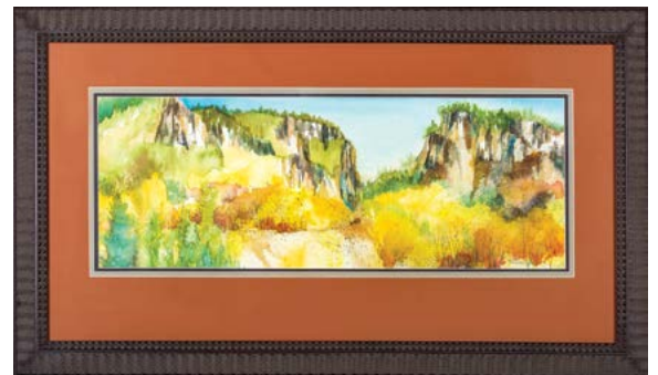
Bonnie Halsey-Dutton, Spearfish; Spearfish Canyon , watercolor on paper