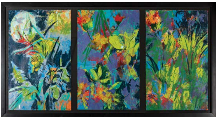
Deborah Mitchell, Rapid City; Moonlight in the Garden , triptych, monotype chine colle print